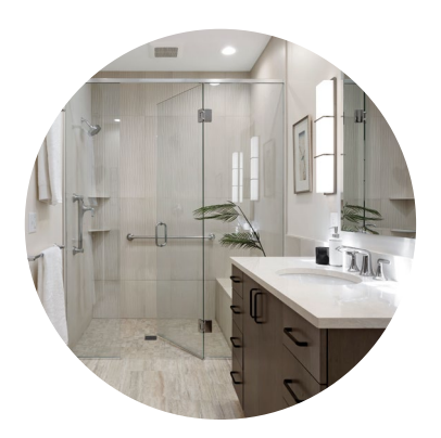
ASID / Kaitlyn Stokes 2nd place large bathroom